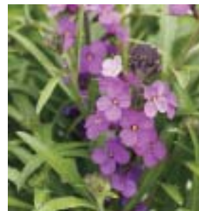
Erysimum ‘Winter Joy’

Proven Winners has some other inspiring early spring combinations, as well as many ideas for planting up containers later in the year – visit www.provenwinners.com for more sensational ideas!