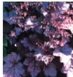
Heuchera ‘Amethyst Mist’