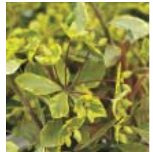
Euphorbia ‘Helena’s Blush’