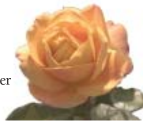
Strike It Rich™ 2007 AARS Winner